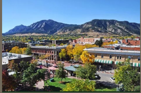
Exhibit & Sponsor Brochure

Great Plains LID Research and Innovation Symposium 2019